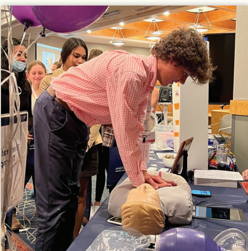
▶ A local Lancaster high school student practices CPR alongside LG Health staff.