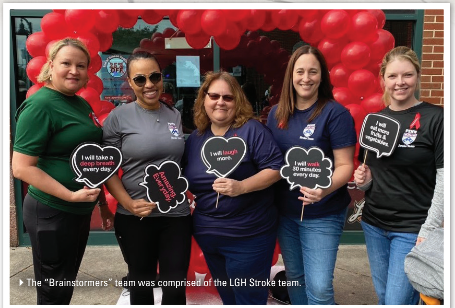
▶ The "Brainstormers" team was comprised of the LGH Stroke team.