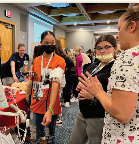
▶ An LG Health staff member walks students through how to use blood pressure technology.

Approximately 155 students each day rotated through eight hands-on activities representing Nursing, Respiratory Therapy, Physical Medicine, Pharmacy, Surgical Technology, Cardiology, Radiology, and the Laboratory Services. The day also included an opportunity to job shadow in a student-selected area of choice.