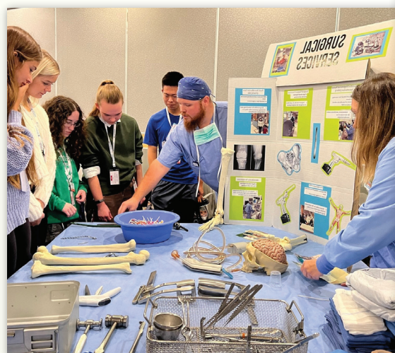
▶ High school students observe a presentation by the Surgical Services team.