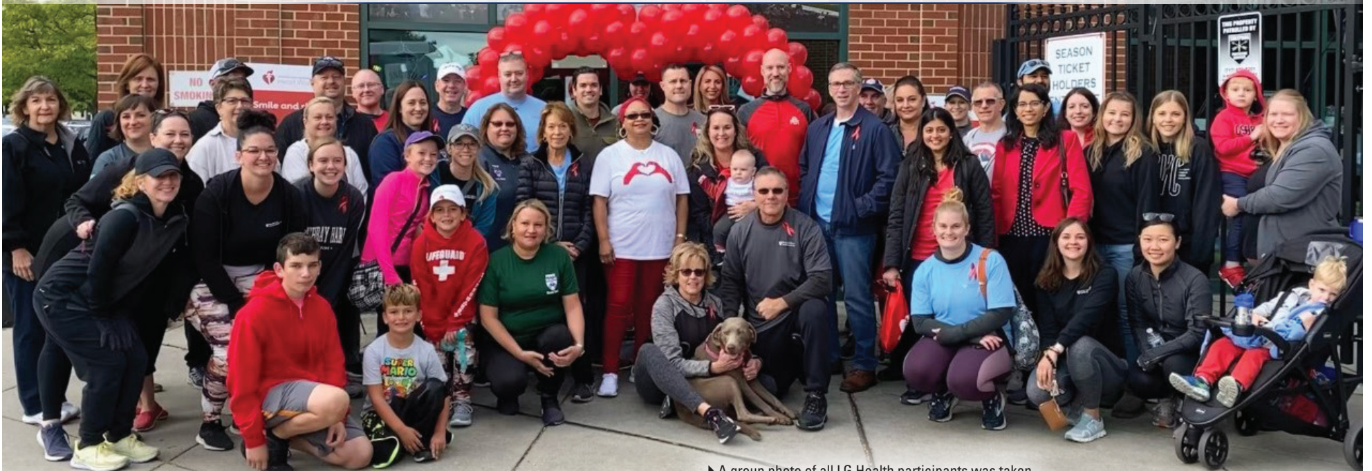
▶ A group photo of all LG Health participants was taken before the walk started outside of Clipper Stadium.

Penn Medicine Lancaster General Health individual employees and teams participated in this year's American Heart Association (AHA) Lancaster Heart Walk on Sept. 24 at Clipper Magazine Stadium in downtown Lancaster. LG Health was the number one participating company, raising over $25,000 to fund life-saving research that will fight cardiovascular disease and stroke, the number one killer and the fifth killer in the United States, respectively.